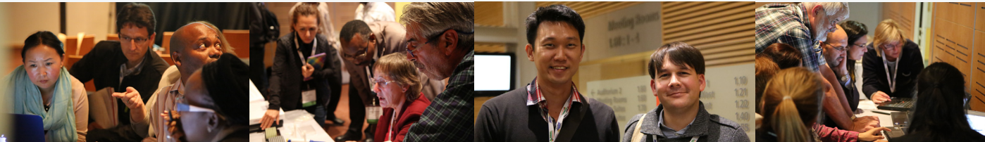
GISAID/isirv-AVG/WHO Training Workshop, Options for the Control of Influenza VIII, Cape Town 2013

GISAID's mechanism does not remove the submitter's interests or rights, such as intellectual property, to the data. This unique sharing mechanism aims to prevent the misuse of shared data.